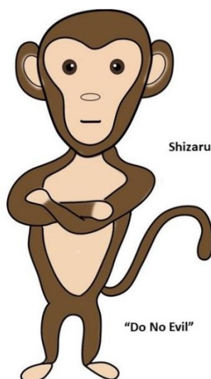
The 4th Monkey

The do no evil mindset would influence our participation in the political process. Our dialogue in conversations around those who are different from us or have different opinions would be positively affected. If we operated each day thinking in terms of do no evil, we would be more empathetic in understanding of each other. We would put ourselves in the shoes of our neighbors and seek to understand their point of, listen to their words and lay the foundation for greater chemistry instead of conflict.